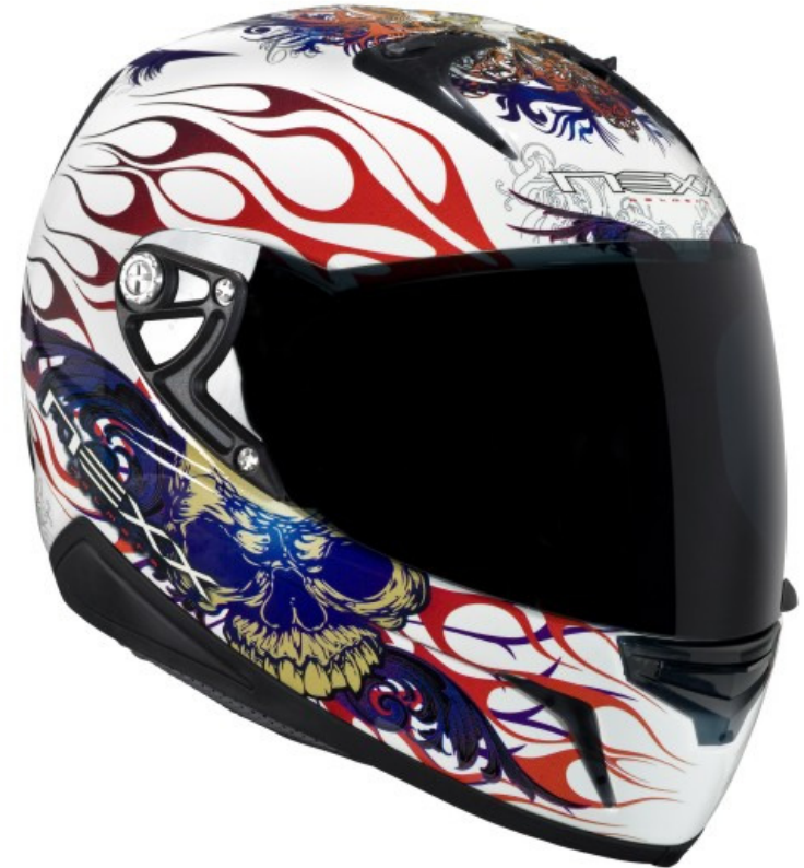
Tattoo White Available