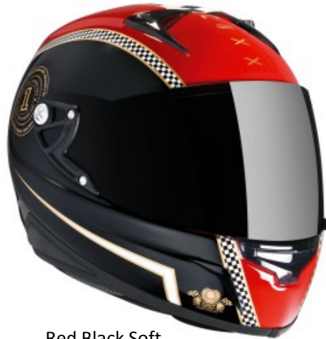
Red Black Soft 01XR104024