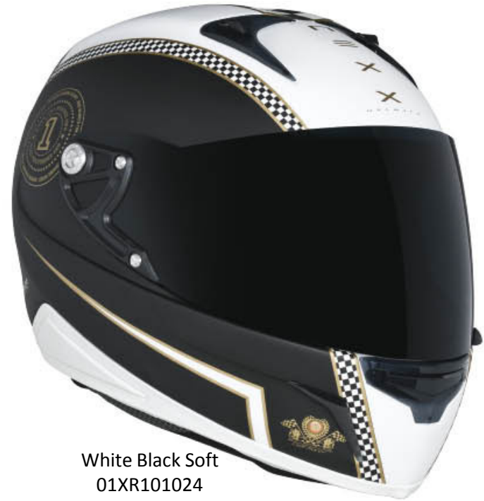
White Black Soft 01XR101024