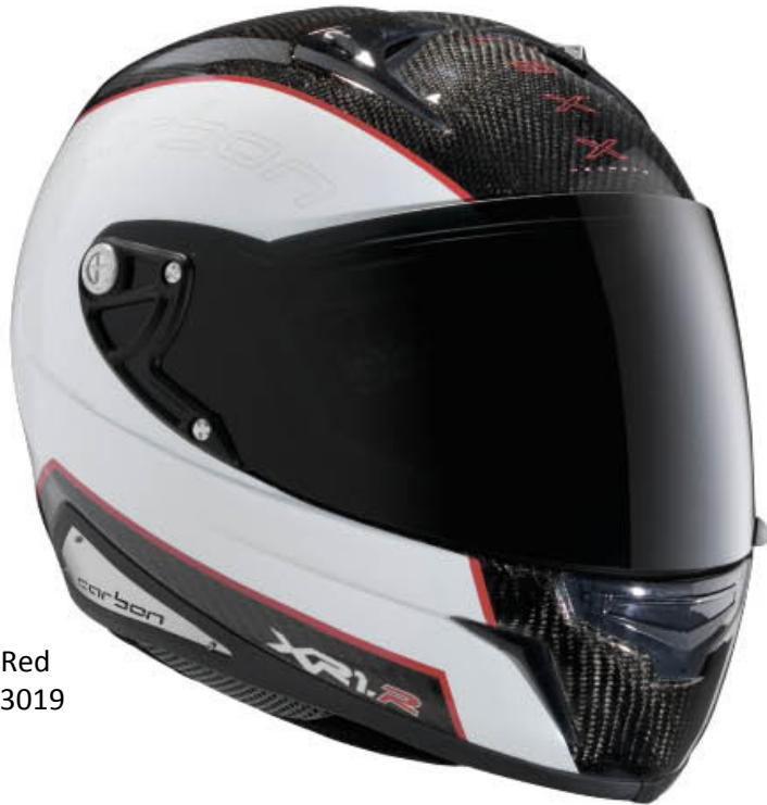
White Red 01XR123019