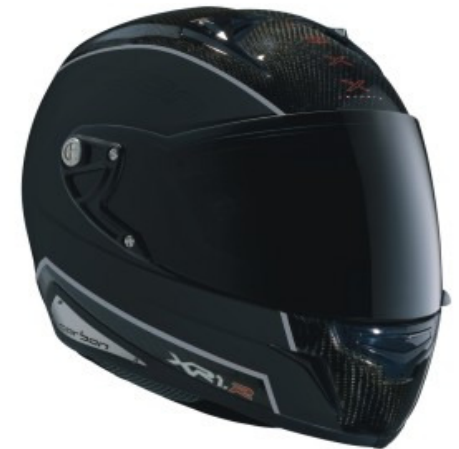
Black Gray 01XR123020