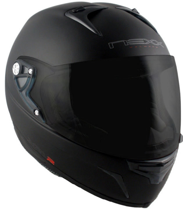
Soft Black & Shiny Black Available