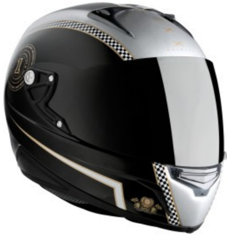
Gray Black Soft 01XR102024