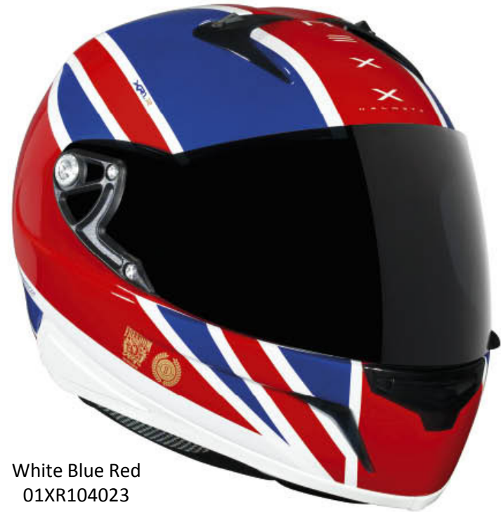
White Blue Red 01XR104023