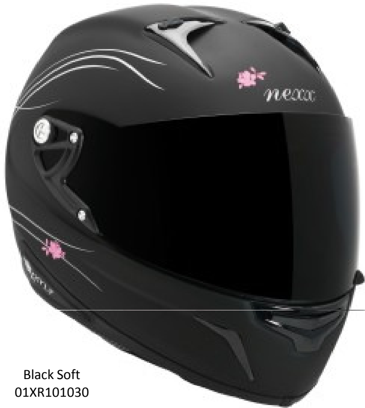
Black Soft 01XR101030